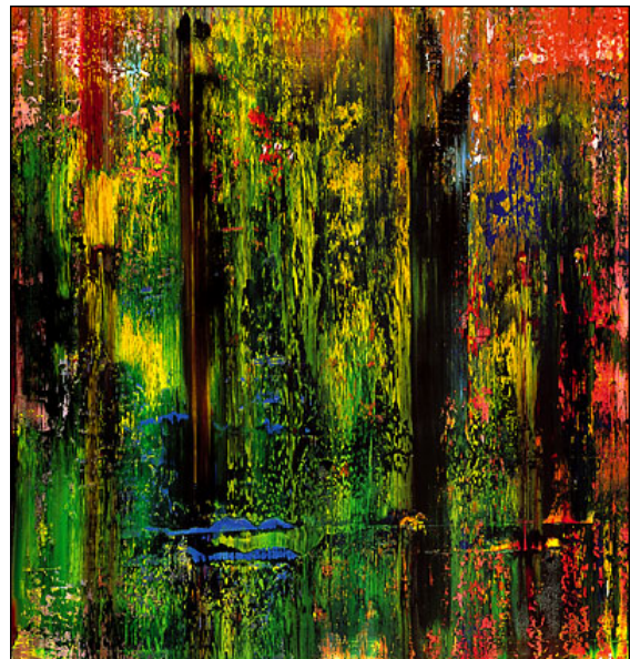
Gerhardt Richter No. 648-2